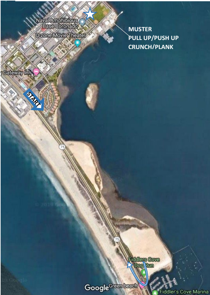
PFT Map Chip